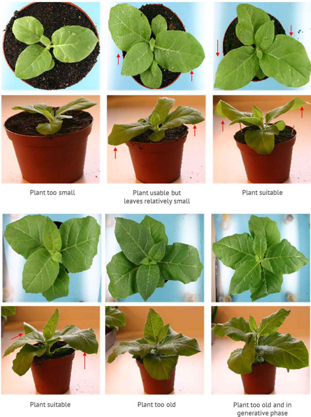
Figure 2. Overview of Nicotiana tabacum cv. Xanthi NN plants in different growth stages (two pictures taken per plant; pot diameter 14 cm)